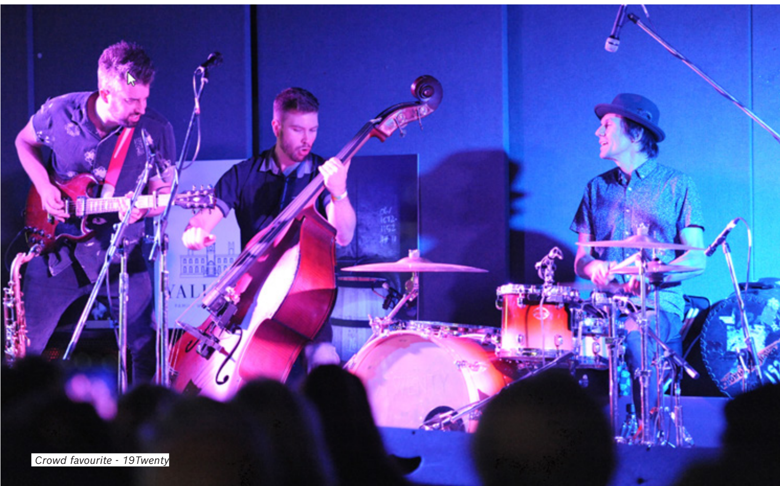
Crowd favourite - 19Twenty

X2 Line Array System & Subs ETX Loudspeaker Systems ZX5A Loudspeaker Systems ZX3 Loudspeaker Systems MFX Monitors DeltaMax Monitors Pheonix Monitors TGX Amplifiers H5000 Amplifiers Madras Loudspeaker System Cobra Loudspeaker System D-Lite Loudspeaker Systems CP Loudspeaker Systems Powermate 1000 Mixers Dynacord Powermate 600 Mixers PM502 Dynacord Mixers ND767 ND967 ND68 ND468 RE510 RE320 RE200