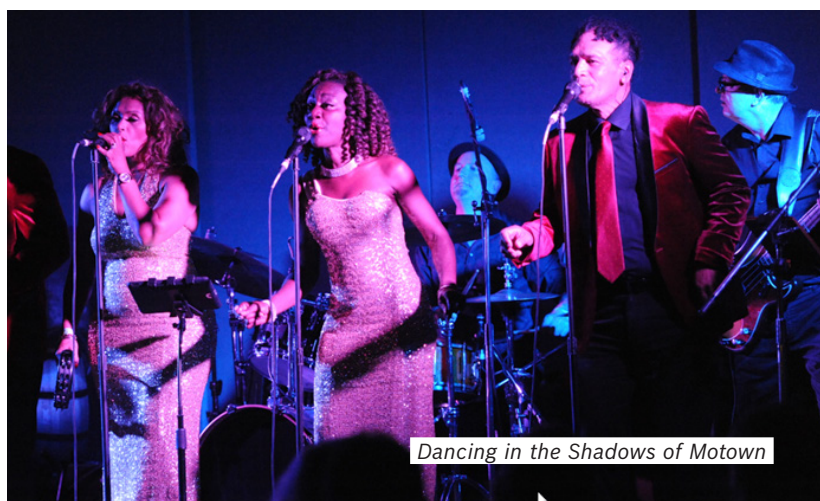
Dancing in the Shadows of Motown

Festival-goers embraced the echo of music at every corner as they strolled through the streets of Thredbo with music continuously playing from 10am to 1am in the various indoor and outdoor venues. The expansive coverage of music required a reliable sound system to ensure the festival ran