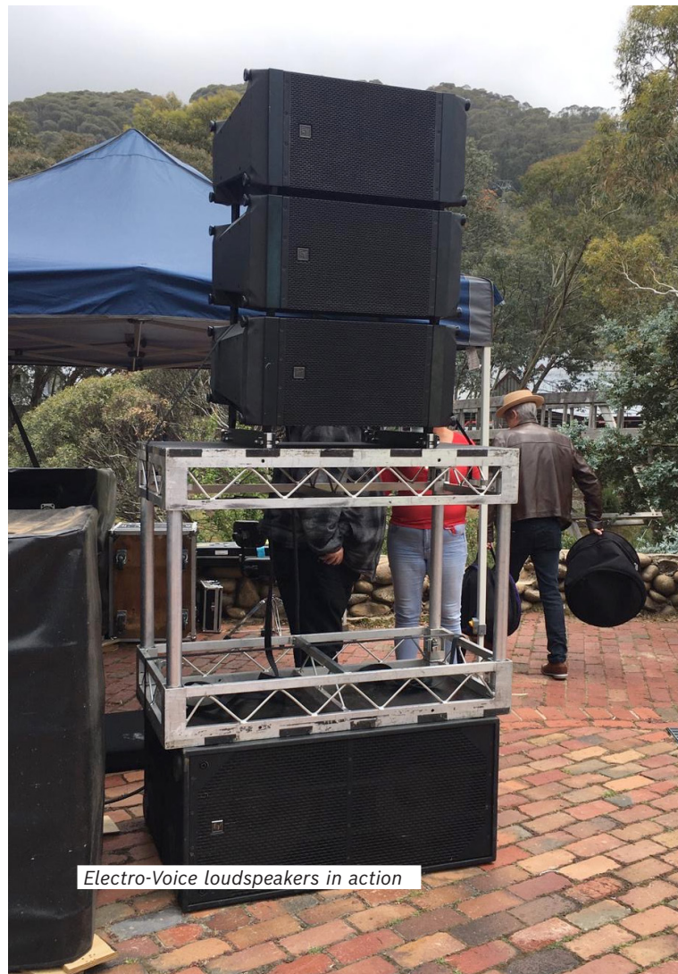
Electro-Voice loudspeakers in action

swinging tunes across the mountains - all supported by a backdrop of Electro-Voice and Dynacord products; undoubtably improving the quality of sound performance and contributing to the festival's vibrant atmosphere that has augmented its success.